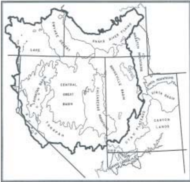
Figure 1 —The Great Basin (Cronquist and others 1972).

and sizes, deplete native vegetation and seedbanks, and open additional areas for weed invasions. The cheatgrass/wildfire cycle frequently provides conditions for replacement by noxious perennial weeds that are even more difficult to control. In 1996, the spread of invasive species on BLM and USDA Forest Service lands was estimated at 4,000 ac (1,600 ha) per day (USDI BLM 1996).