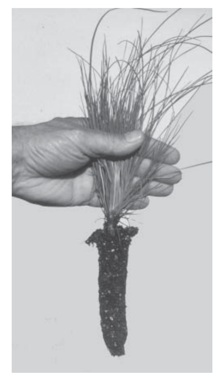
Figure 2—Typical longleaf pine container seedling.

Nearly 40 million seedlings are being grown at the 4 nurseries in the southeastern US we surveyed. About 82% of the container seedlings are longleaf pine, followed by 10% loblolly, 6% slash, with 2 nurseries growing about 600,000 "other" seedlings representing 27 species (Table 1; Aiking 2003; McRae 2003; Parkhurst 2003; Pittman 2003). In the South, seedlings are generally outplanted within 2 windows: "summer" which includes April through August (particularly the