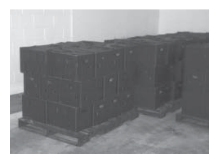
Figure 5—Once extracted, seedlings can be held for short periods in refrigerated storage until planting.

types of questions should lead to enhanced seedling quality. And, quantifying physiological and morphological characteristics and how they interact during various storage conditions and lengths would be helpful for determining when and for how long seedlings could be stored. Ideally, this type of research would follow seedlings all the way to the outplanting site.