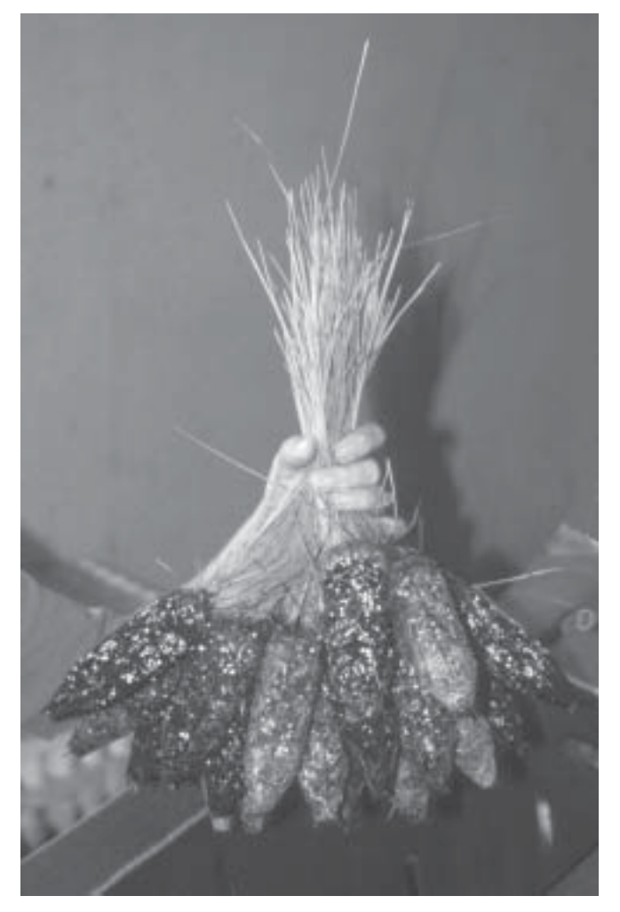
Figure 3—Seedlings are extracted by hand.

optimum foliar nitrogen, or even the range of suitable nitrogen concentrations, is still unknown. We see a need to document the influence of growing seedlings at lower irrigation frequencies to improve water use efficiency and hasten development of cold hardiness in late summer. Answering these