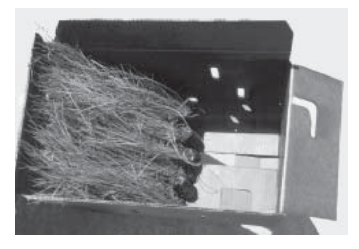
Figure 4 —Seedlings are place into wax-coated boxes for storage and shipment. Boxes are generally designed for produce and have slits or holes for ventilation and hold between 125 and 400 seedlings.