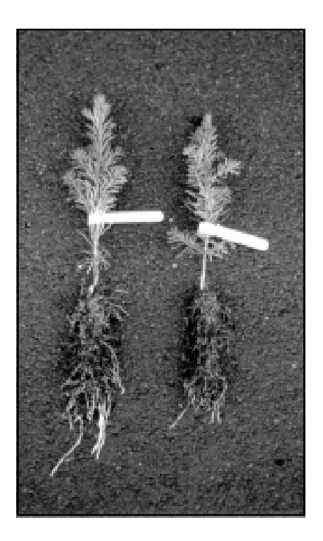
Figure 1. RGP test showing differences in the number of new roots produced by 2 noble fir plugs.

For most stock types, ninety sample trees are divided into 18 groups of 5 trees each. For larger stock types such as 1+1 and 2+1, the sample trees are divided into 30 groups of 3 trees each. Each group is potted into a one gallon pot in peat:perlite (3:2) mix. Pots are placed into insulated boxes to protect the roots from freezing temperatures. Fifteen trees (3-5 groups) are then exposed to four or five sub-freezing temperatures in a controlled freezer (Thermatron, Holland, Michigan). Depending on the lift date, temperatures are selected to bracket the LT_{10} and LT_{50} . For each exposure, the temperature is lowered at a rate of 5°C per hour, held at the test