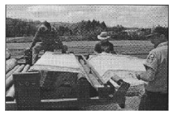
Figure 3. Roller-upper.