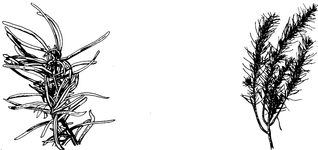
Figure 1.--Appearance of Lygus damage in 1-0 D.f. seedling (L) and resulting multiple tops in the 2-0 year (R).

recognized as a common cause of bud abortion and terminal growth deformation in bare root Douglas-fir (D.f.) seedlings. Lygus feeding near the growing tip of 1-0 seedlings results in stem lesions, distorted needles, and deformed tops (Figure 1). Following bud damage, lateral shoots frequently form weak multiple tops (forking) that persist through harvest (Figure 1). Although Lygus bugs are a common problem in agricultural crops, they are an unfamiliar pest to most nursery managers.