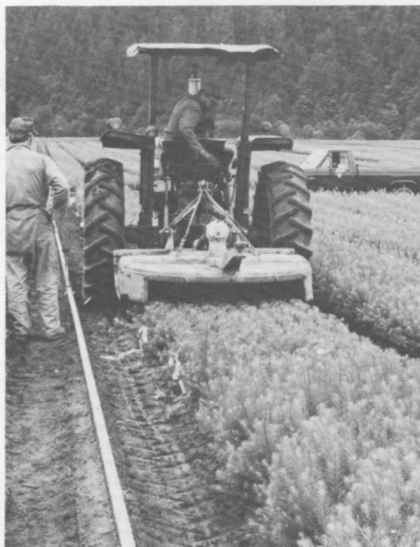
Figure 1.--Top pruning with a rotary mower at the D.L. Phipps Forest Nursery (Oregon State Department of Forestry).

Top pruning. --This study was installed in May, 1983, to examine the effects of top pruning on 2+0 Douglas-fir seedling morphology, survival, and growth. Top pruning is a common practice in western nurseries (fig. 1); however, there is little available information about the effects of top pruning. Treatments for the experiment include two different pruning heights, two different times of application, and one multiple pruning. The entire experiment, with one seed zone was replicated at three nurseries; a smaller version, involving fewer treatments, was included so that more seed sources could be tested. In total, six nurseries (fig. 2) and nine seed zones are involved in the study. Test seedlings from each seed zone will be planted on sites located within their respective zones. In addition, a common garden study, including seedlings from all seed zones, will be established at the OSU McDonald Forest. The growth and survival of outplanted seedlings will be monitored for up to three years.