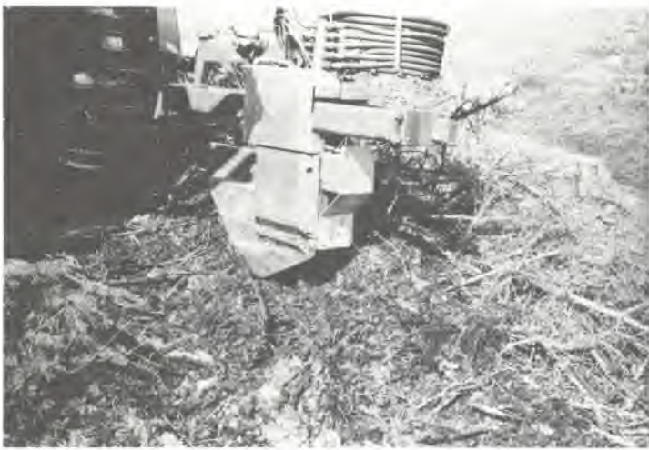
Figure 4. Planting head of Serlachius Planting Machine.