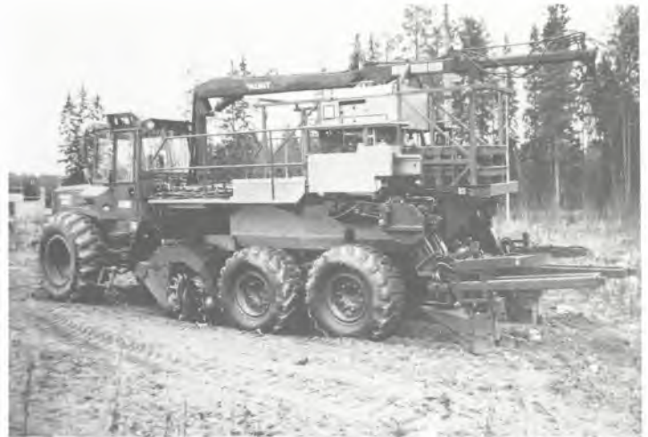
Figure 3. Serlachius Planting Machine.

The feeding system is loaded with five pallets, giving a planting capacity of 2,000 peat pot seedlings. The pallet is opened automatically and the seedlings are fed to the planting heads. The empty pallets are stacked on a separate frame. About once every hour the driver must feed in a new set of five pallets. The machine can carry planting stock for up to four hours of operation.