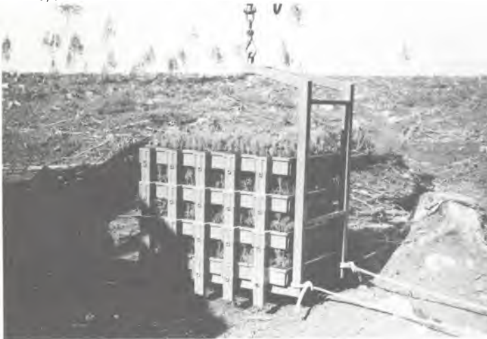
Figure 2. Standard pallets used for growing, transporting and loading seedlings onto planting machine.

A European standard-size plastic pallet (100 cm x 120 cm) is used as the basic unit for growing and transporting the containerized seedlings (Fig. 2). It is also used as the basic unit in our planting machine (Fig. 3).