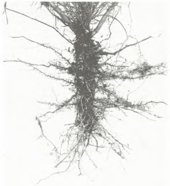
Figure 2. Chemically box-pruned root of a lodgepole pine plug seedling two seasons after planting.