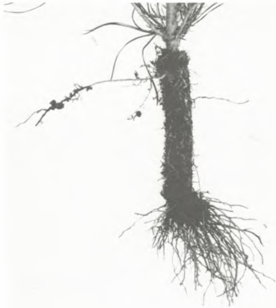
Figure 1. Root of an ordinary lodgepole pine plug seedling two seasons after planting.