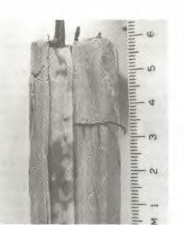
Figure 2.--Container with portion of outer coating and wall removed showing lateral root development.