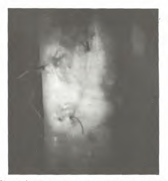
Figure 4.--Inner coating of container showing slash pine root tips which have forceably penetrated the wax (X3.5).

The type of wax appears to be a significant factor for root escape. It is apparent that root tips more easily penetrate some waxes than others. Also, there is no chemical reaction between roots and some types of wax.