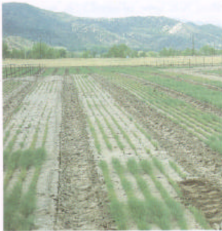
Figure 55-4 —Often the stunted, chlorotic seedlings occur in irregular patches throughout the seedbed.