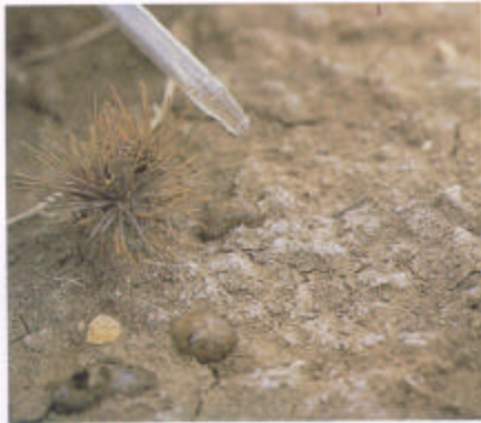
Figure 55-6 —One simple test for calcareous soils is to apply a drop of dilute acid to the soil surface, which will produce a “fizzing” reaction.