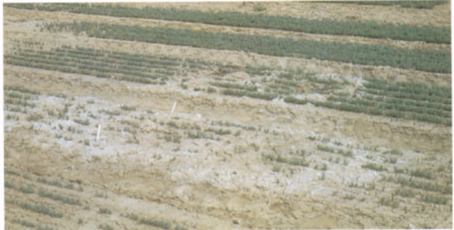
Figure 55-5 —Visible salt crusts often form on the surface of saline soils.