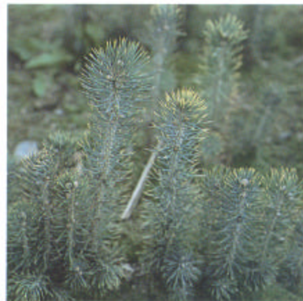
Figure 55-2 —High soluble salt levels cause a physiological drought, resulting in a "burn" of needle tips or leaf margins.

described in terms of total salinity, or concentrations of specific salt ions. An electrical conductivity measurement of the irrigation water or a saturated paste of the soil is the best way to measure total salt load. Concentration of individual salts can be measured by a laboratory test of a water extract of the soil.