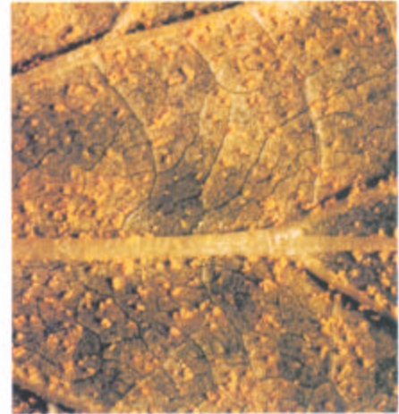
Figure 24-6 —Uredinial pustules on underside of Ribes leaf.

Pycnia produce tiny, pear-shaped pycniospores that are exuded in a drop of yellow-orange fluid. The pycniospores serve only a sexual function. In the spring, following