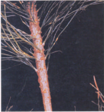
Figure 24-4 —Drops of pycnial fluid on stem of white pine.