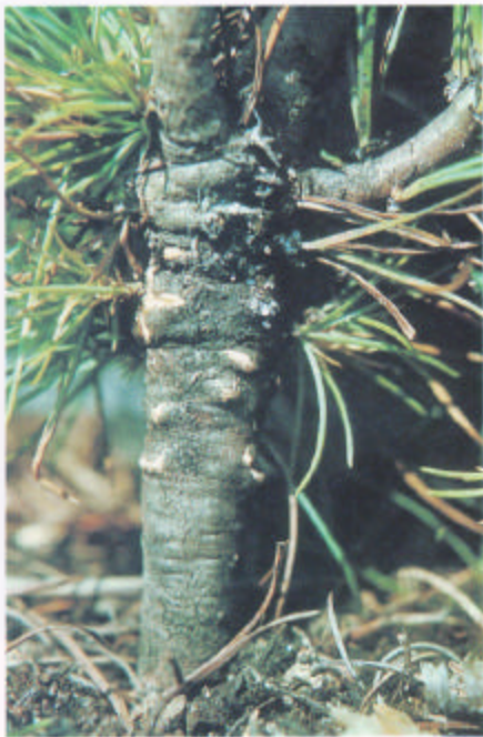
Figure 24-5 —Aecia of C. ribicola .

Ribes —On Ribes , uredinia appear in the summer as small, yellow-orange pustules on the underside of leaves (fig. 24-6) and produce granular clumps of orange urediniospores.