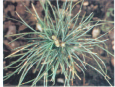
Figure 24-1 —White pine seedling with yellow needle spots caused by C. ribicola .

Pines —On pines, look for yellow needle spots (fig. 24-1). Spots have various patterns: there are yellow spots with brown, necrotic centers; yellow and red spots; or even spots that are entirely red (fig. 24-2). Later, a spindle-shaped swelling with yellow to orange discoloration of the bark (fig. 24-3, left) or a sunken, brown, necrotic, girdling canker bordered by typical discoloration (fig. 24-3, right) may appear on the stem.