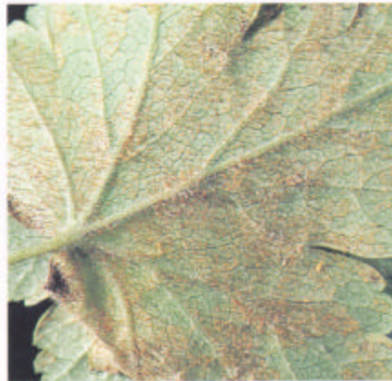
Figure 24-7 —Telial columns on underside of Ribes leaf.

During late summer and early fall, brown, hairlike telial columns up to 2 cm long appear on the underside of the leaf, either from the uredinia or directly from the leaf tissue (fig. 24-7). The abundance of telia on Ribes leaves is a good indicator of the potential blister rust hazard to nearby white pine seedlings.