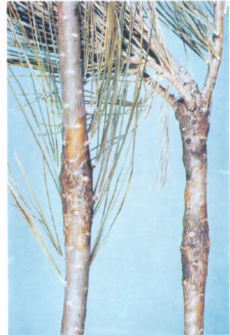
Figure 24-3 —Spindle-shaped swellings on stems of white pine seedlings, caused by C. ribicola .

Infection of 2-0 or older seedlings may not produce visible symptoms before they are lifted. Consequently, infected trees may not be detected in cursory inspection of nursery beds, or in routine culling procedures.