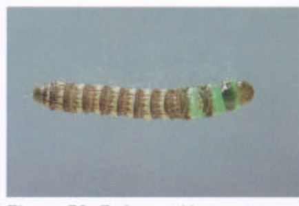
Figure 50-5-Larva of lesser cornstalk borer.

After emerging from the soil in late spring, moths mate, and female moths deposit eggs singly in the soil at the bases of host plants or on stems and lower leaves. Each female lays approximately 125 eggs. Eggs hatch within 1 week, and larvae mine lowermost