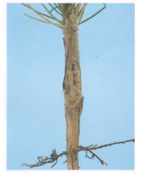
Figure 50-4—Callused feeding wound on seedling stem made by larvae of lesser cornstalk borer.

protect inactive or disturbed larvae, can sometimes be seen radiating from feeding sites.