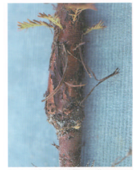
Figure 50-3 —Gall-like swelling on seedling stem just above girdle made by larvae of lesser cornstalk borer.