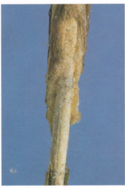
Figure 50-2—Feeding wound made by larvae of lesser cornstalk borer.