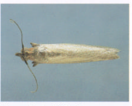
Figure 50-6-Adult of lesser cornstalk borer.

branches or begin semisubterranean feeding on stems and roots. Larvae feed from 2 to 3 weeks. Pupation occurs in silk tunnels or soil litter and takes 2 to 3 weeks. Then new adults emerge, mate, and live about 10 days. Larvae or pupae overwinter in