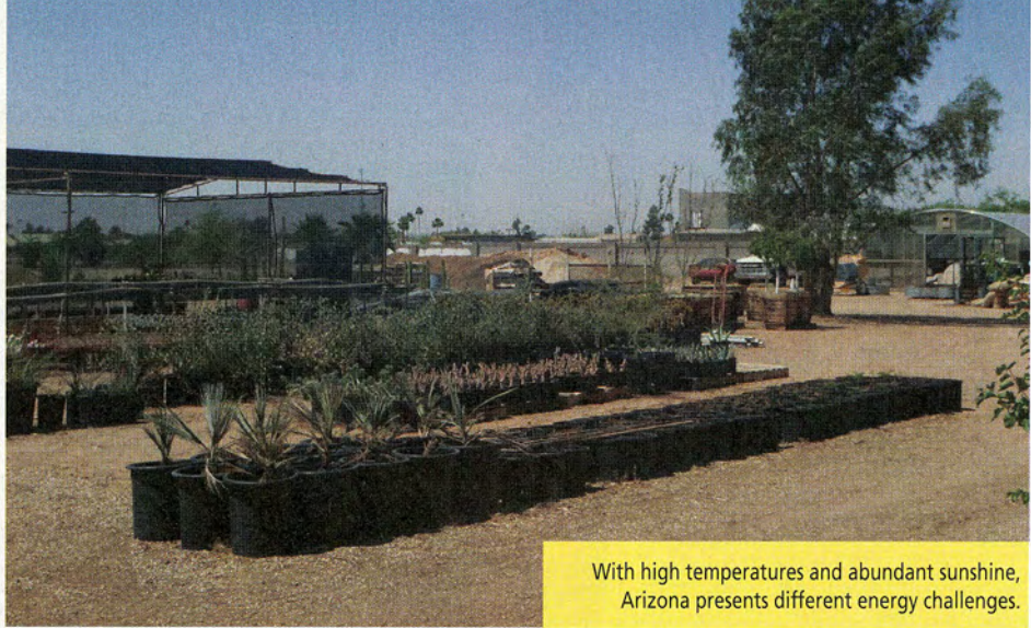
With high temperatures and abundant sunshine, Arizona presents different energy challenges.

Department of Agriculture! Good grief, don't we all hate that? What I mean