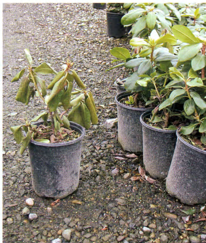
Fig. 1. Soil and gravel beds contaminated with plant debris can lead to new infections in the next crop of container plants. Solarization offers a way to disinfect these soil-gravel beds and break the disease cycle.

Healthy container plants commonly become infected when they are placed on these contaminated soil-gravel surfaces in can yards or in greenhouses. Spores of the pathogen