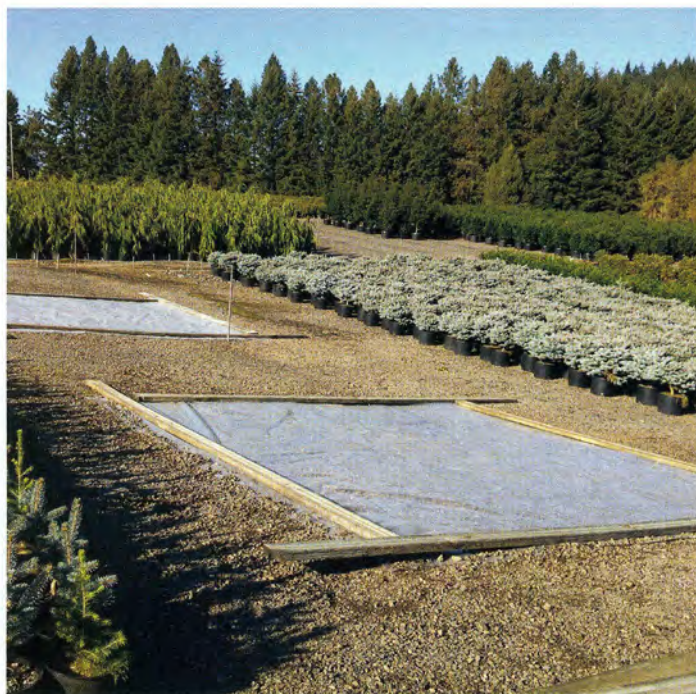
Fig. 5. A solarization trial at a commercial nursery in Oregon.