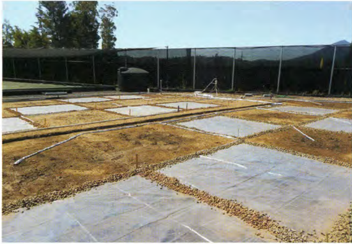
Fig. 2. Experimental solarization plots at the NORS-DUC site in California.