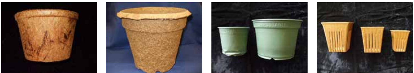
Figure 2. Some alternative containers are made from wood fiber, recycled paper or cardboard.

Containers made from these alternative components usually are compostable but may not biodegrade quickly when planted. Biodegradable (plantable) containers are left on the root ball when planted into the landscape or another larger container. They are usually designed to allow roots to penetrate container walls and to decompose quickly after planting. Compostable containers must be removed before planting and are designed to be broken apart and composted.