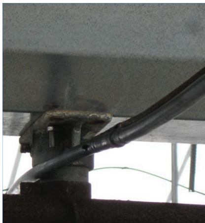
Many fabricators can customize a gutter to fit older post tops in both wood rafter houses and steel frame structures.