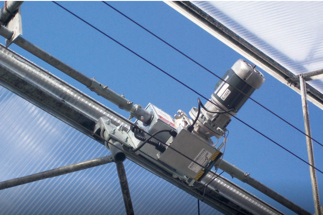
Left photo: Roof vents are usually the best option for natural ventilation to add to an existing structure. Right photo: Many older greenhouses have good structural integrity and can easily be upgraded with polycarbonate or acrylic structured sheets. Bottom photo: Photo shows glass structure (right side) that is being retrofitted with double poly film (left side).