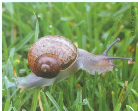
Snails, such as this ordinary brown garden snail, can cause problems for homeowners and gardeners as well as production nurseries.

shrews, birds, predacious beetles and sciomyzid flies all have an effect on populations. Note that two commercially available natural enemies — a nematode, Phasmarhabditis , and the decollate snail — are not legal to use in the United States (except for the decollate snail in a small region of California).