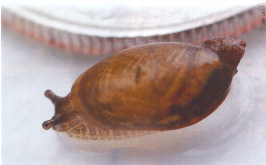
No matter how small, gastropods such as this amber snail ( Oxyloma sp. ), shown crawling next to a dime, can cause huge headaches for growers. There are many ways these pests can be managed and eliminated.

Voracious slugs and snails are no match for an integrated battle plan