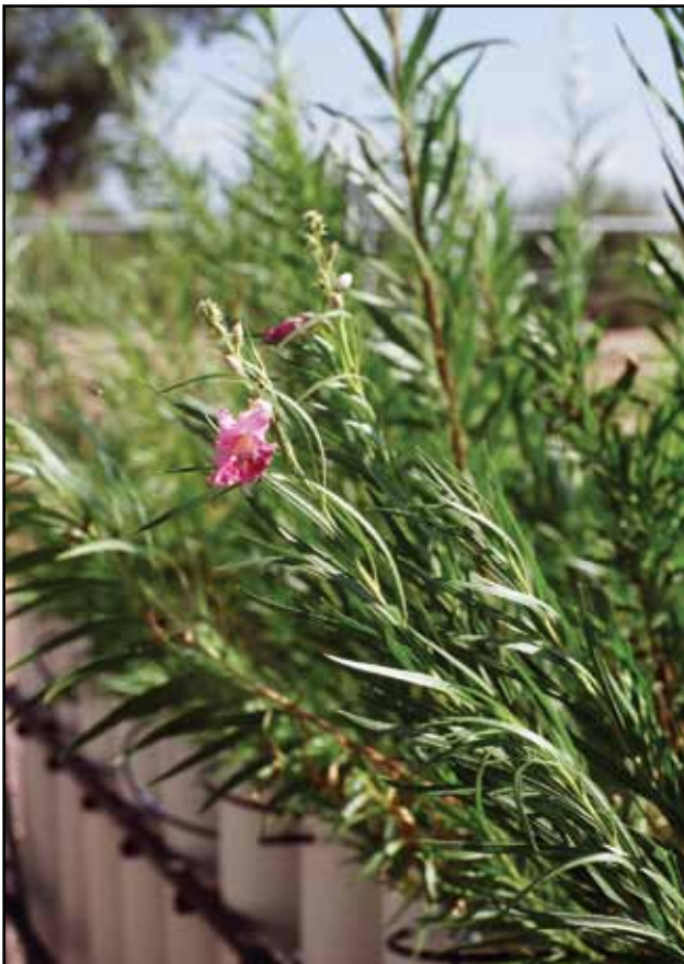
Desert Willow in bloom while still in tall pot.