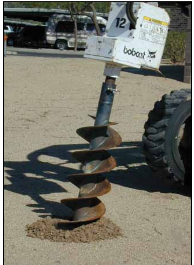
Typical 8-inch diameter auger used to drill tall pot planting holes.