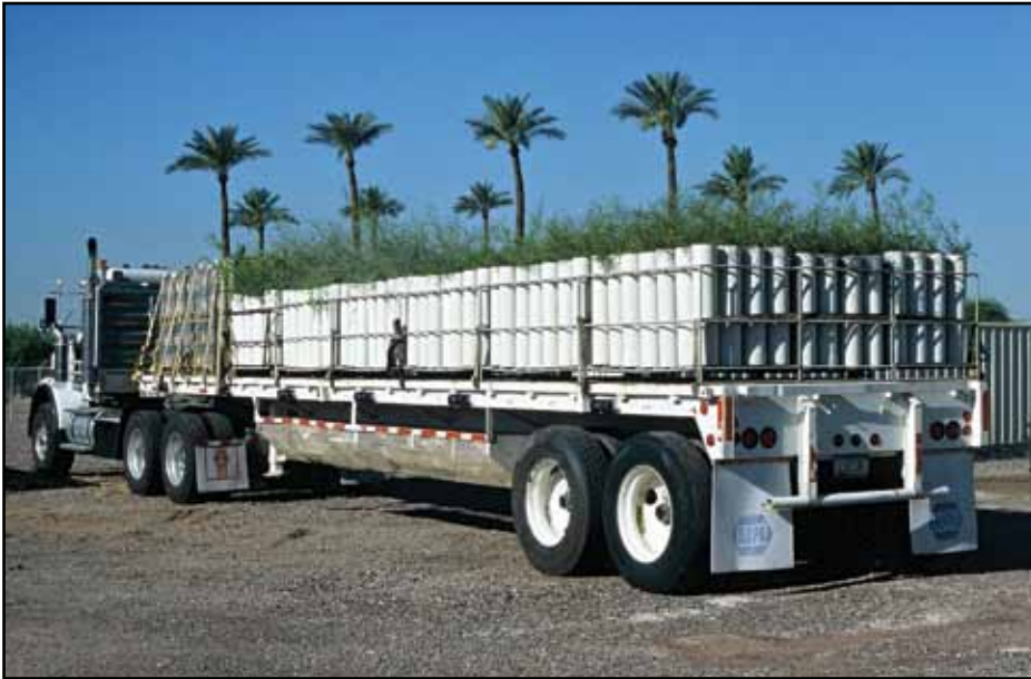
FCDMC Tall Pot Nursery showing Ironwoods ready to deliver to project site.

For this project FCDMC grew trees using Tall Pot technology by cutting 10-foot lengths (six inches in diameter) of #D2729 PVC, into 4 30-inch tubes. Squares of wire mesh hardware cloth were placed in the bottom to hold the soil and