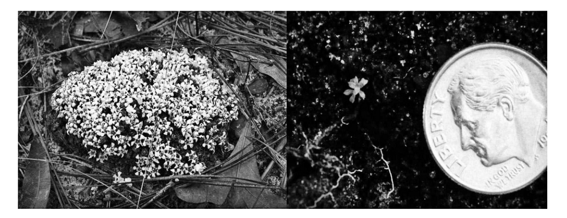
Fig. 1. Winter-flowering Pyxidanthera brevifolia in full bloom on Fort Bragg (left) and ex situ propagated P. brevifolia seedling (right). Left photo taken 25 March 2009.

tablishment efforts, to identify the optimal germination conditions for P. brevifolia seeds, and to identify possible environmental controls on seed germination for this endemic Sandhills species.