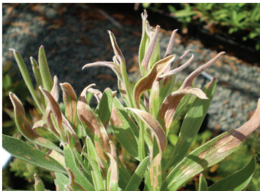
Figure 6. Example of phytotoxicity on Leucospermum 'Succession II'.