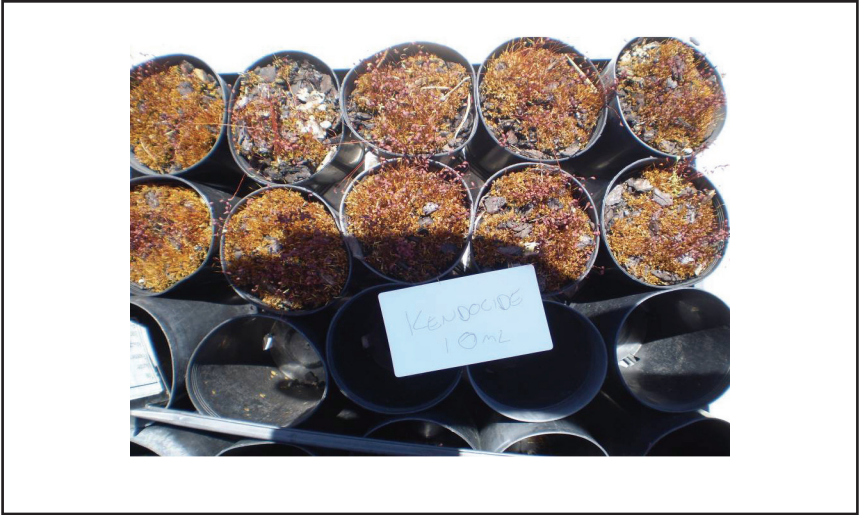
Figure 3. Example of browned moss (Kendocide 10 ml·L -1 ).