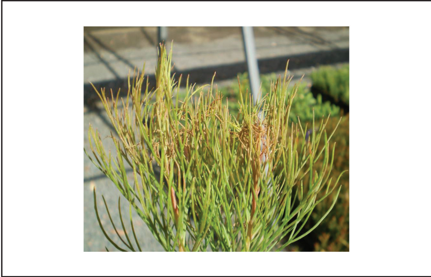
Figure 7. Example of phytotoxicity on Serruria 'Blushing Bride'.