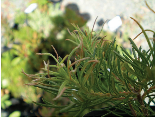
Figure 5. Example of phytotoxicity on Banksia ('Birthday Candles').

A follow-up trial was conducted using Surrender and Kendocide (both at a medium rate) but not vinegar as a negative result was achieved at the lowest possible rate. Both chemicals produced the same result as that found at the high rate of application as above.