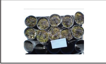
Figure 1. Blackened fruiting bodies on the iron-sulphate-treated moss.