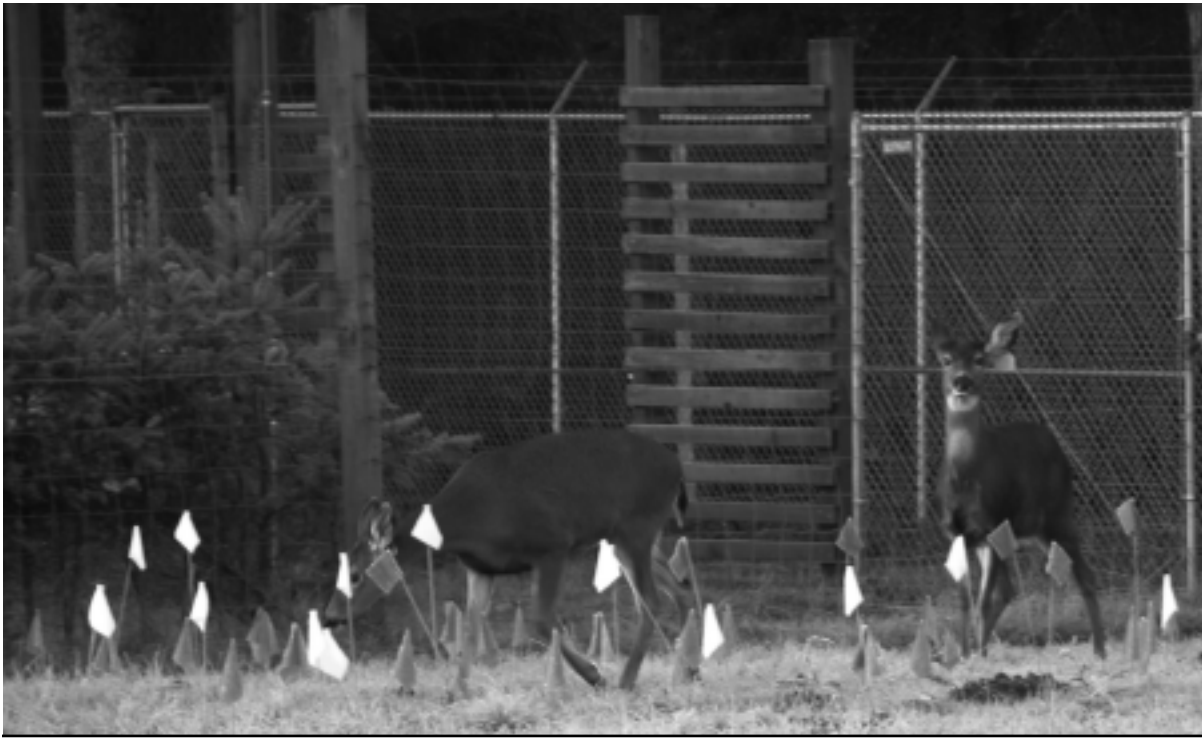
Figure 1. Western redcedar feeding choice trial with Columbian black-tailed deer at the USDA National Wildlife Center, Olympia Field Station.