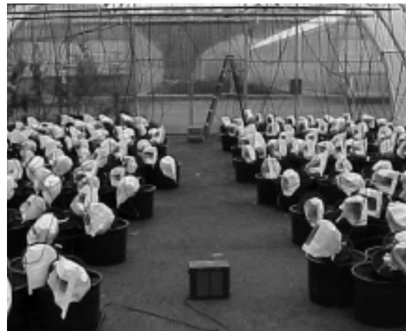
Figure 4. Breeding young western redcedar trees at Cowichan Lake Research Station.

A breeding program for enhanced needle monoterpene concentrations is currently underway at Cowichan Lake Research Station. Over 60 “not preferred” selections (minimal deer browse and enhanced needle monoterpenes) from a base population of approximately 2500 range-wide western redcedar trees have been selected for the