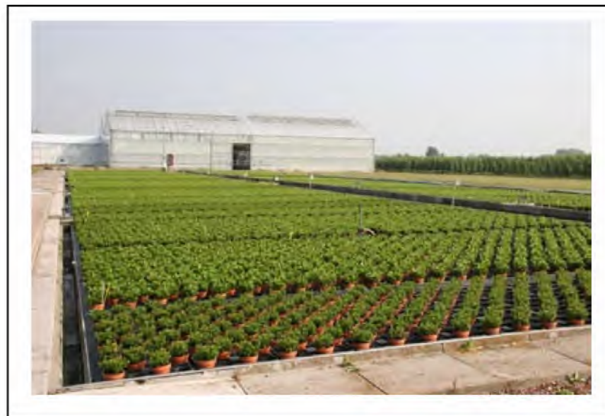
Figure 2. Plants in the beds outside the greenhouse.

is laid over the lava but not so heavy that it supports weed growth. In these systems it is important to irrigate the bed before containers are stood down, especially in dry seasons; otherwise the lava will draw water from the containers.