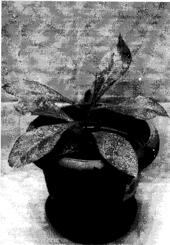
Figure 7 Chlorotic spots on leaves due to Mn deficiency

absence of leaf tip and the reduction in the size of leaf lamina towards the base, resembling the cauliflower whiptail (Figure 8).