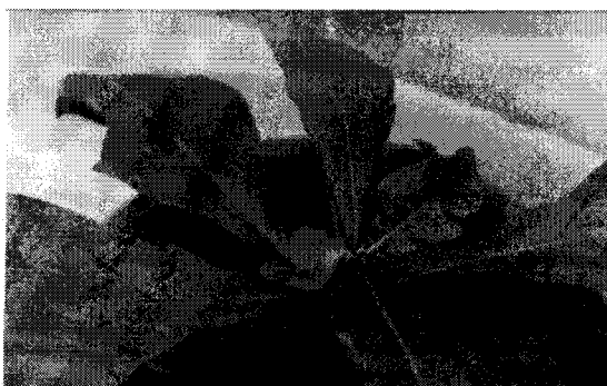
Figure 4 Small and wrinkled new leaves due the deficiency of Cu