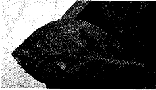
Figure 5 Chlorosis of midrib and veins due to the deficiency of Zn