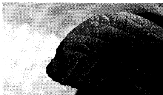
Figure 3 Chlorosis followed by leaf tip necrosis due to the deficiency of Cu