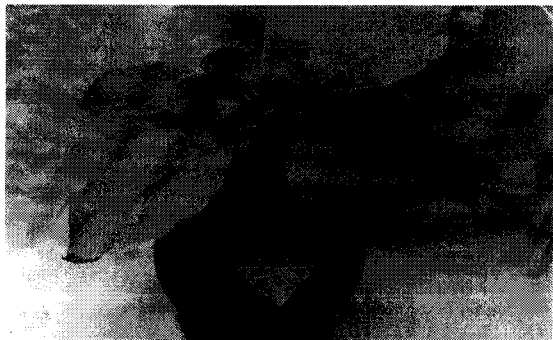
Figure 9 Clustering of new leaves due to the deficiency of B