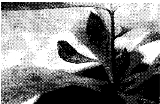
Figure 2 Cupping and inward curling of leaves due to Fe deficiency