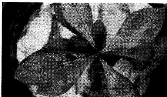
Figure 1 Interveinal yellowing of new leaves due to Fe deficiency

-Mo plants developed yellow patches on the tip and upper margin of older leaves 65 days after planting. These patches gradually spread to the entire margins and finally became necrosis. In some plants leaves became bluish-green in colour. As in Cu-deficient plants newly matured leaves expressed vein-clearing symptoms but remained green in the interveinal area. The characteristic symptom observed in Mo-deficient plants was the