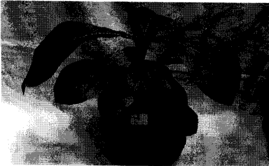
Figure 6 Large and drooping new leaves due to the deficiency of Zn