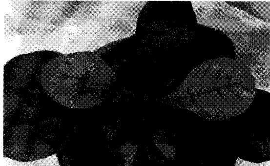
Figure 8 Shortening of leaf lamina and absence of leaf tip due to the deficiency of Mo

Foliar symptoms observed in the forest nurseries expressed by the root trainer-grown teak seedlings included yellowing of younger leaves, curling and cupping of leaves, vein clearing with the appearance of reticulate pattern and wrinkling of new leaves; these were similar to the induced symptoms of Fe and Cu deficiencies. In root trainer nurseries foliar symptoms were observed even at the two- to four-leaf stage. In clonal