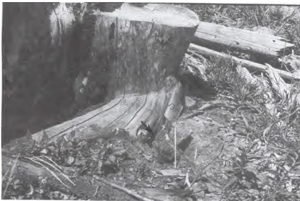
Figure 4 —Whitebark pine seedling outplanted in the shade of a stump to protect it from intense heat, help with conservation of water, and to act as a barrier to shifting snow and soil.

harsh sites, but whitebark pine fills a niche that we would typically avoid planting with other conifers. With continued monitoring in the field and with research studies, we can refine the prescriptions for survival, increase populations of rust resistant trees, and contribute to the population of regenerating whitebark pine. Working with our nursery partners in developing an efficient and affordable growing regimen that develops target seedlings is the key to outplanting success for whitebark pine.