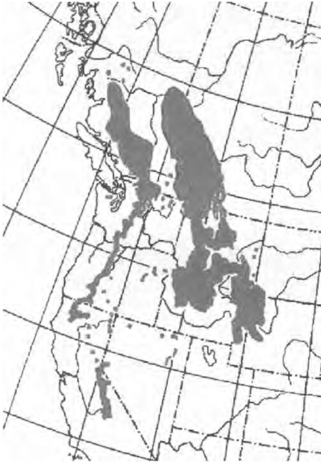
Figure 1—Natural distribution range of whitebark pine in western North America. Diagram courtesy of Whitebark Pine Ecosystem Foundation Web site, reproduced from Arno and Hoff (1989).

since his study. In drier-colder conditions such as east of the Continental Divide, the rate of spread of blister rust has been slower and mortality is low. However, infection rates are increasing. Additionally, white pine blister rust kills the upper portion of the cone bearing trees before the tree succumbs to the disease, effectively ending seed production and the opportunity for regeneration.