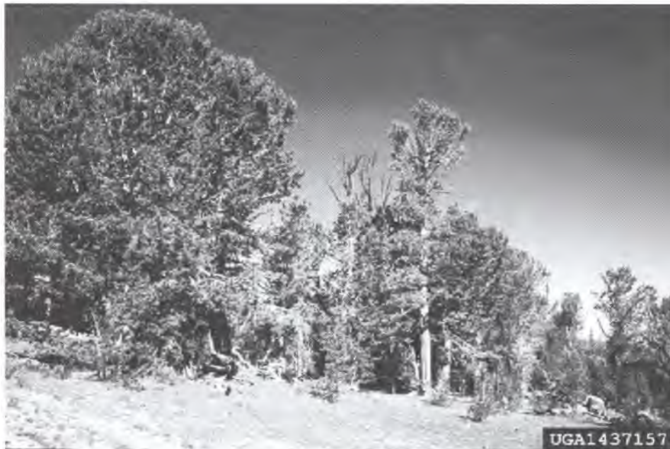
Figure 3—Mature large crowned whitebark pine produce the most cones.

Nutcracker planted seeds are stratified by overwintering in cold environments where they are subjected to long periods of cold, moist conditions. These conditions help the seeds to overcome physical and physiological barriers to