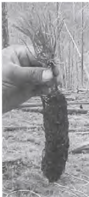
Figure 5 —Whitebark pine seedling grown in a large container plug showing a well developed root system that helps seedlings adapt to planting sites.

harsh sites, but whitebark pine fills a niche that we would typically avoid planting with other conifers. With continued monitoring in the field and with research studies, we can refine the prescriptions for survival, increase populations of rust resistant trees, and contribute to the population of regenerating whitebark pine. Working with our nursery partners in developing an efficient and affordable growing regimen that develops target seedlings is the key to outplanting success for whitebark pine.