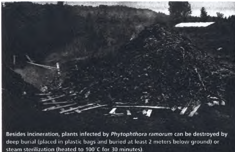
Besides incineration, plants infected by Phytophthora ramorum can be destroyed by deep burial (placed in plastic bags and buried at least 2 meters below ground) or steam sterilization (heated to 100°C for 30 minutes).