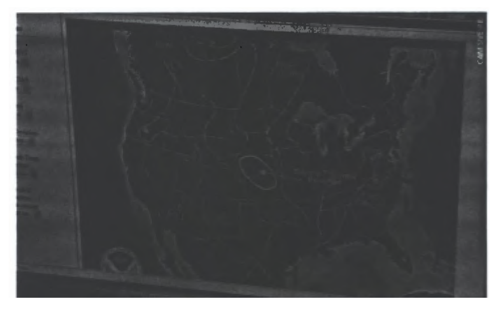
ERF Company uses weather-tracking data, such as this pressure-systems map on the National Oceanic and Atmospheric Administration site, to make forecasts for clients.