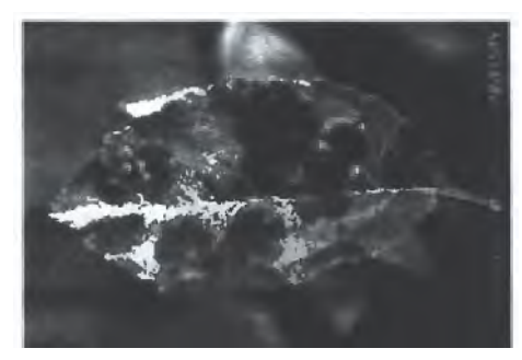
With accurate weather forecasting, growers can apply copper to crops and avoid apple scab infections, which are caused by moist conditions at certain temperatures.

Brooks Tree Farm in Salem, Ore., has subscribed to Volker's service for more than 10 years. Co-owner