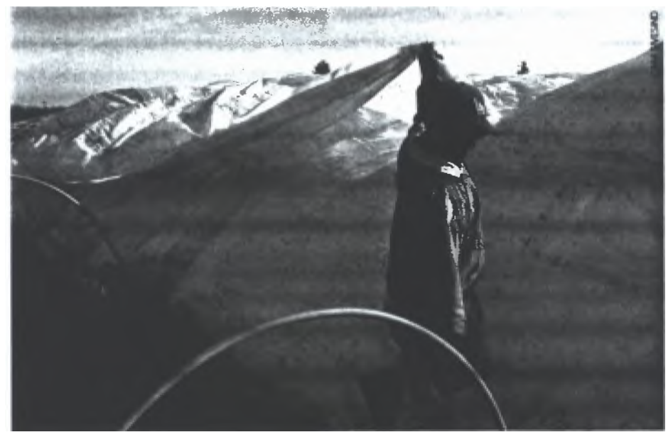
Growers use meteorological forecasts to get a jump on pulling or placing poly over sensitive crops.