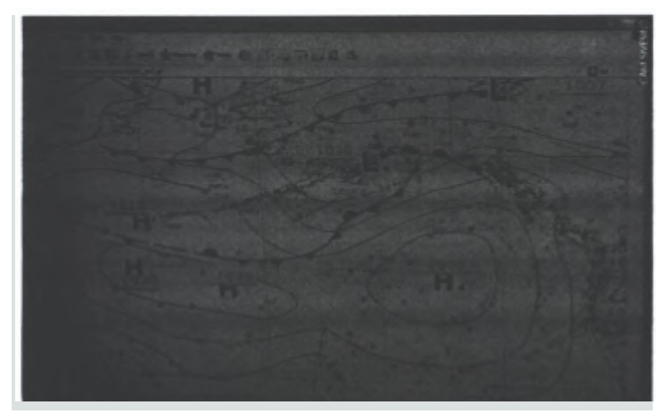
Phil Volker used this ocean surface pressure-systems map to help a freighter shave a week off a trip from China to Portland, guiding the vessel through calm seas under a high-pressure system.

cold or too wet, I'll ask them if they're sure they can plant," LeCompte says.