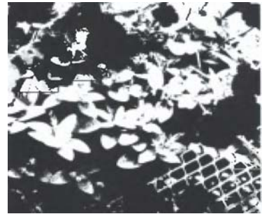
Degradable Jumbo Ellepots can be used as "bump-ups" in the greenhouse for 12- or 113-inch baskets.

Greenhouse growers can cut production time on the bench by using the Jumbo Ellepots because of faster rooting times. Growers may plant Jumbo Ellepots in a 12- or 18-inch basket in March instead of