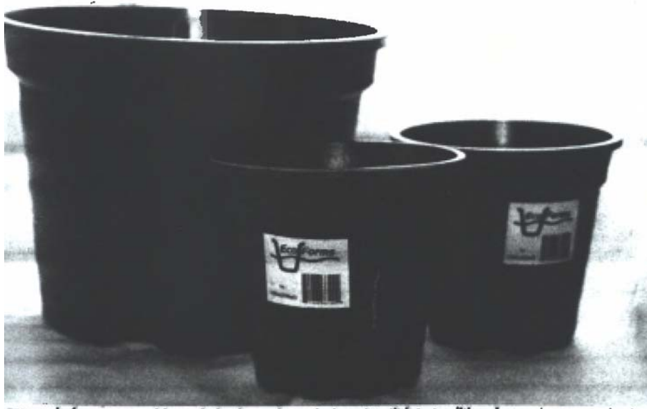
are made from renewable grain husks and are designed to fit into traditional greenhouse production.

EcoForms can be customized with barcodes,