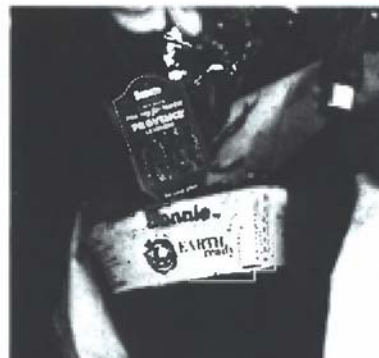
Bonnie Plant Farm grows vegetables and herbs in the 5-inch peat pots from Jiffy.

Any type of crop can be successfully grown in the Earth Ready pots, but shorter crops such as bedded plants and vegetables perform