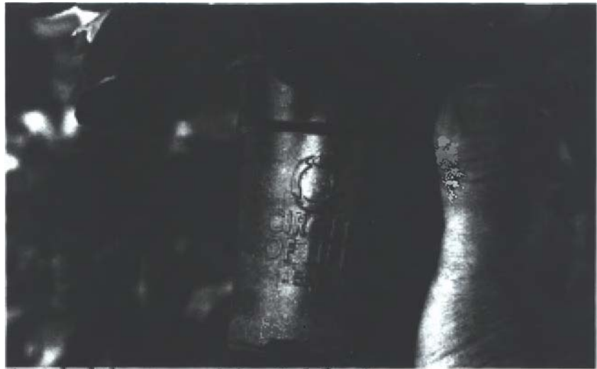
The Circle of Life pots are made from rice hulls and support annual and perennial plant production.

The pots are available in 4-inch, 4½-inch and 6-inch and they're embossed with the Circle of Life logo.