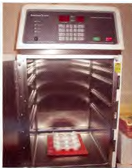
Figure 2. Indented carton of acorns on top of photographic paper on bottom of X-ray machine.