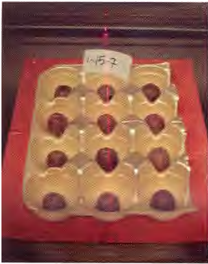
Figure 1. A sample of acorns, arranged vertically in indented carton, ready to be X-rayed.