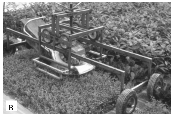
Figure 3 - Top pruning with rotary mowers is a routine practice in many bareroot conifer nurseries (A). Ornamental container growers have modified lawnmowers to top prune their stock (B).