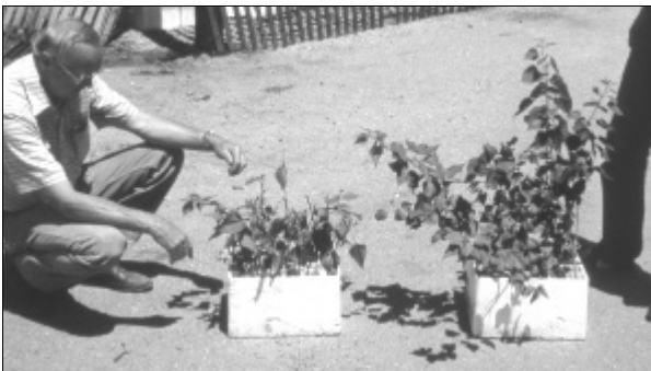
Figure 1 - Top pruning is often the only option for crops like quaking aspen ( Populus tremuloides ) that produce tall shoots with minimal fertilization.

Controlling plant height is always a challenge because shoot growth is stimulated in modern nursery environments (Figure 1). To further aggravate the problem, economics forces nurseries to grow their stock at high densities and so plants want to outgrow their neighbors. Inducing mild stresses helps to slow height growth but this has only limited application. Chemical treatments like paclobutrazol have proven effective with floral crops, but have not found wide application in forest and conservation nurseries. Therefore, many growers resort to top pruning which is also called top mowing or clipping.