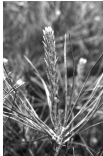
Figure 4 - Trees and shrubs with indeterminate growth should be top pruned before the expanding terminal shoot becomes woody; in pines, this is called the “pinfeather” stage.

Of course, the objectives of the seedling user would determine whether initially forked plants would be a problem. Foresters are concerned about producing trees with straight boles but forking would not be important for nursery stock used for restoration or other non-