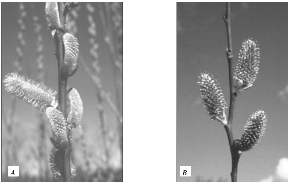
Figure 2 - The sex of willows, cottonwoods, and aspens can easily be determined when the plants are in flower (A = male, B = Female).

Willow and cottonwood seed should be sown immediately with several seeds per cavity. They can be direct sown