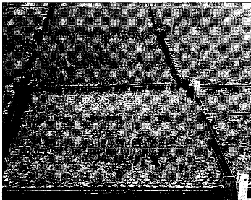
Fig. 5. Mosaic pattern stunting can also occur in containers. In this case, the cause is uneven compaction of the growing medium.

Variable compaction of growing media—Porosity in artificial growing media is always critical but especially so in small volume containers. Smaller pores (micropores) must supply seedlings with water and mineral nutrients while larger ones (macropores) provide gas exchange for the roots. Over-compaction of growing media eliminates the macropores which causes reduced growth and eventual stunting. Uneven compaction between individual cells or areas in blocks of containers can result in mosaic seedling growth patterns (Fig. 5). One common cause of compaction is overmixing with