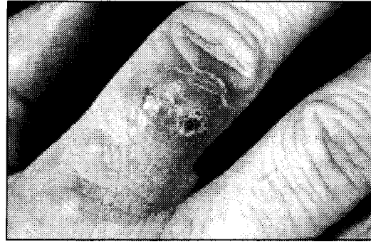
Figure 10. The first symptom of sporotrichosis is a small skin lesion that does not respond to normal treatment.