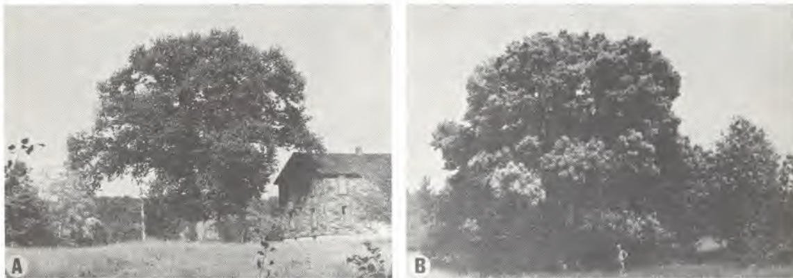
Figure 3. A. A large blight-free American chestnut (168 cm d.b.h.) in Lake County, B. This American chestnut tree was from Kalkaska County.

From the start it was obvious that some trees in Michigan were more damaged by blight than others (Figures 3 and 4). However, it was not known whether some trees were more resistant or certain strains of the fungus more deadly. In 1977, after reading the article by Van Alfen et al. (1975) and talking with the individuals from the Connecticut Agricultural Experimental Station, it became obvious that the situation in Michigan was in some ways similar to that in Europe where Michigan American chestnut trees have cankers that have callused (healed) naturally.