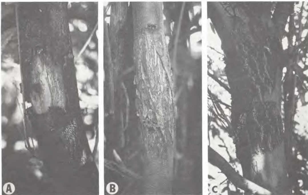
Figure 5. A. A typical virulent or killing canker taken in Allegan County. B. A swollen superficial canker from the Grand Haven location. C. A superficial canker from the Benzie-Manistee County line site. This canker is less swollen, lacks the yellowish-orange color, and has a callus layer on the outer portion of the bark.

Although only the Grand Haven and Rockford sites have confirmed hypovirulence at this point, I have observed significant numbers of superficial cankers at 24 localities in southwestern and five in northwestern Michigan (Figure 1). These superficial cankers which persist for many years are nearly always swollen and show signs of continuous growth whereas the virulent cankers are nearly always flush with little or no swelling to surrounding bark, and without noticeable callusing tissue. The superficial cankers vary in shape and form from one location to another. In a couple of sites in the northwestern part of the Lower Peninsula the superficial cankers are less swollen and lack the yellowish-orange color. These cankers tend to have a callus layer on the outer portion of the bark (Figure 5).