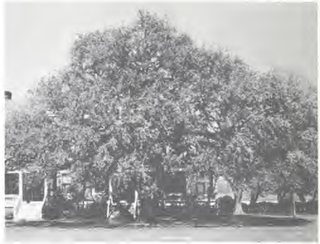
Figure 4. The Algernonne Oak ( Quercus virginiana ) at the U. S. Army Compound, Fort Monroe, Virginia. Named for Fort Algernonne, the first fort built at Point Comfort in 1609, the present site of Fort Monroe. Branch spread is 100 ft (30.5 m), circumference is 20 ft (6.1 m) at 2 ft above ground level, and age has been estimated by R. J. Stipes to be between 303 years (minimum, based on age of a major leader) and 437 years (most likely figure, based on age of single, major bole at 2 ft above ground level).

Quercus virginiana , a tree of history and beauty, is relatively slow growing and attains tremendous size with age, having a possible span of 46 m (150 ft), trunks up to 1.8 - 2.1 m (6 - 7 ft) and a height of 15.2 - 22.8 m (50 - 75 ft). It branches near the ground into massive and wide-spreading limbs, and forms a broad, dense, round-topped crown of dark, glossy leaves (Lindgren et al. , 1949; Fowells, 1965; May, 1972). Many large and old, therefore historic specimens adorn landscapes in the Tidewater area of Virginia, especially at Hampton Institute and at the United States Army Compound, Fort Monroe, both at Hampton, Virginia (Fig. 4). This species apparently has been relatively resistant to disease and insect attack until the introduction of the chestnut blight organism around 1900 after which time several species of oak including live oak contracted the disease.