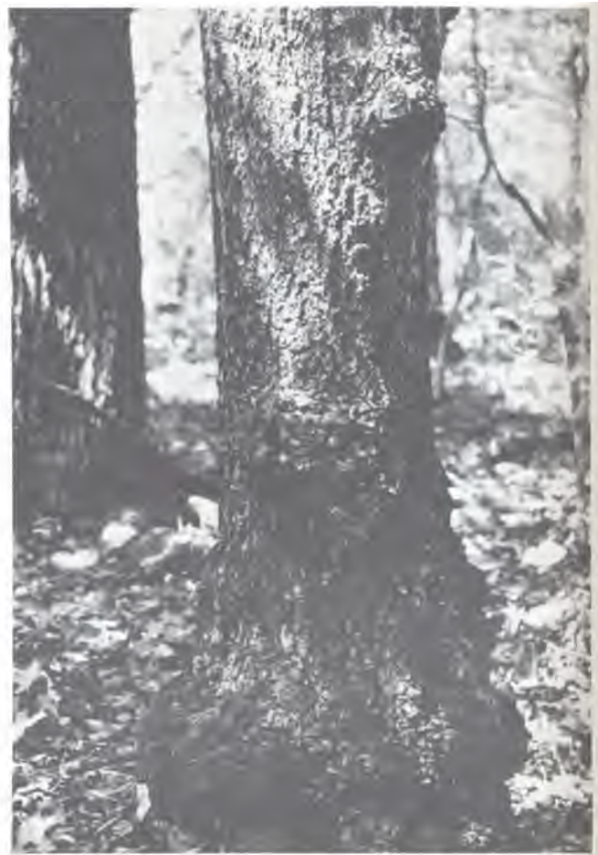
Figure 2. Swollen butt of scarlet oak ( Quercus coccinea ) resulting from infection by Endothia parasitica . Photo courtesy of Dr. D. L. Ham (Ham, 1967).