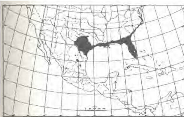
Figure 3. Distribution of live oak, Quercus virginiana (Fowells, 1965).

Quercus virginiana , variously known as live oak, Eastern live oak, Virginia live oak, scrub live oak, dwarf live oak and Rolfs oak, has a fairly restricted range, extending in a narrow coastal strip from Virginia to Georgia where the range widens to embrace the southern third of Georgia and all of Florida to Key Largo (Fig. 3). It again becomes a coastal strip tree from western Florida to Texas, where its range widens, extending about 483 km (300 mi) inland (Alexander, 1953; Fowells, 1965). Little (1944) lists several cultivars, macrophylla , virescens , typica , eximea , fusiformis and geminata . Although live oak is sensitive to low temperatures which thereby presumably restrict its range, a nice specimen thrives in the Appalachians at Blacksburg, Virginia (altitude about 640 m = 2,100 ft). Several large specimens thrive also at Richmond, Virginia.