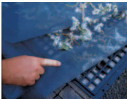
Capsules are allowed to open on top of a wooden table. From bottom to top, the layers include a layer of newspaper, a plastic spacer, a sheet of fiberglass window screen, willow capsules, and a final layer of fiberglass window screen. The pieces are held in place with large thumbtacks.