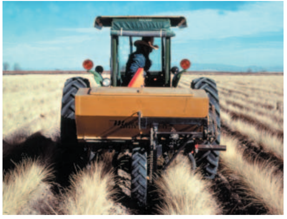
Figure 2. Using a side dresser to fertilize a grass seed field at the USDA Natural Resources Conservation Service Aberdeen Plant Materials Center in Idaho.

number of acres planted under dryland conditions failed to establish.