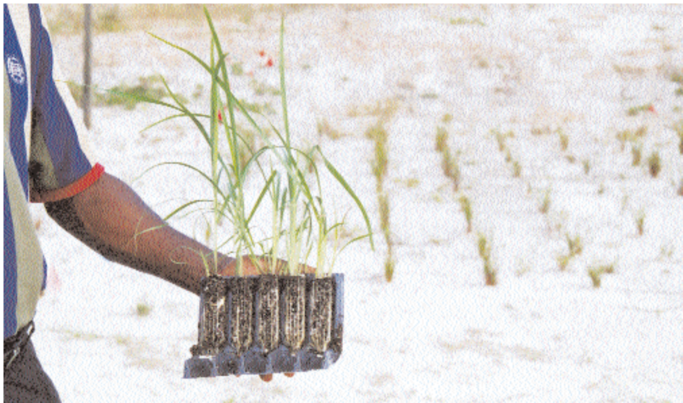
Figure 1. Tissue-cultured creeping bluestem plants prior to planting.

in creeping bluestem survival. On overburden, plantings were sprayed 5 to 6 times compared with 2 to 4 times on sand tailings (see Table 1). A large soil seed bank had been allowed to build up after overburden and sand tailings were deposited and leveled. Legumes (rough hairy indigo, shyleaf, coffeebean, and showy crotalaria ( Crotalaria spectabilis Roth [Fabaceae]) (in this order) seem to be the major broadleaf problems because of their abundance and resistance to herbicide treatments. No single herbicide was effective on all weed problems. Plateau was relatively effective on most broadleaf species and grasses (except Brachiaria sp. (Trin.) Griseb. [Poaceae]), but Weedmaster was needed for pusley ( Richardia spp. L. [Rubiaceae]) and most legumes. Only Remedy was effective on rough hairy indigo.