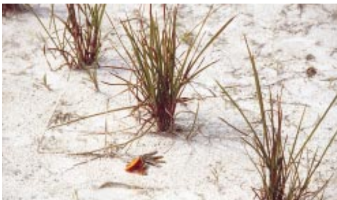
Figure 2. Tissue-cultured creeping bluestem plants on sand tailings 6 mo after outplanting.