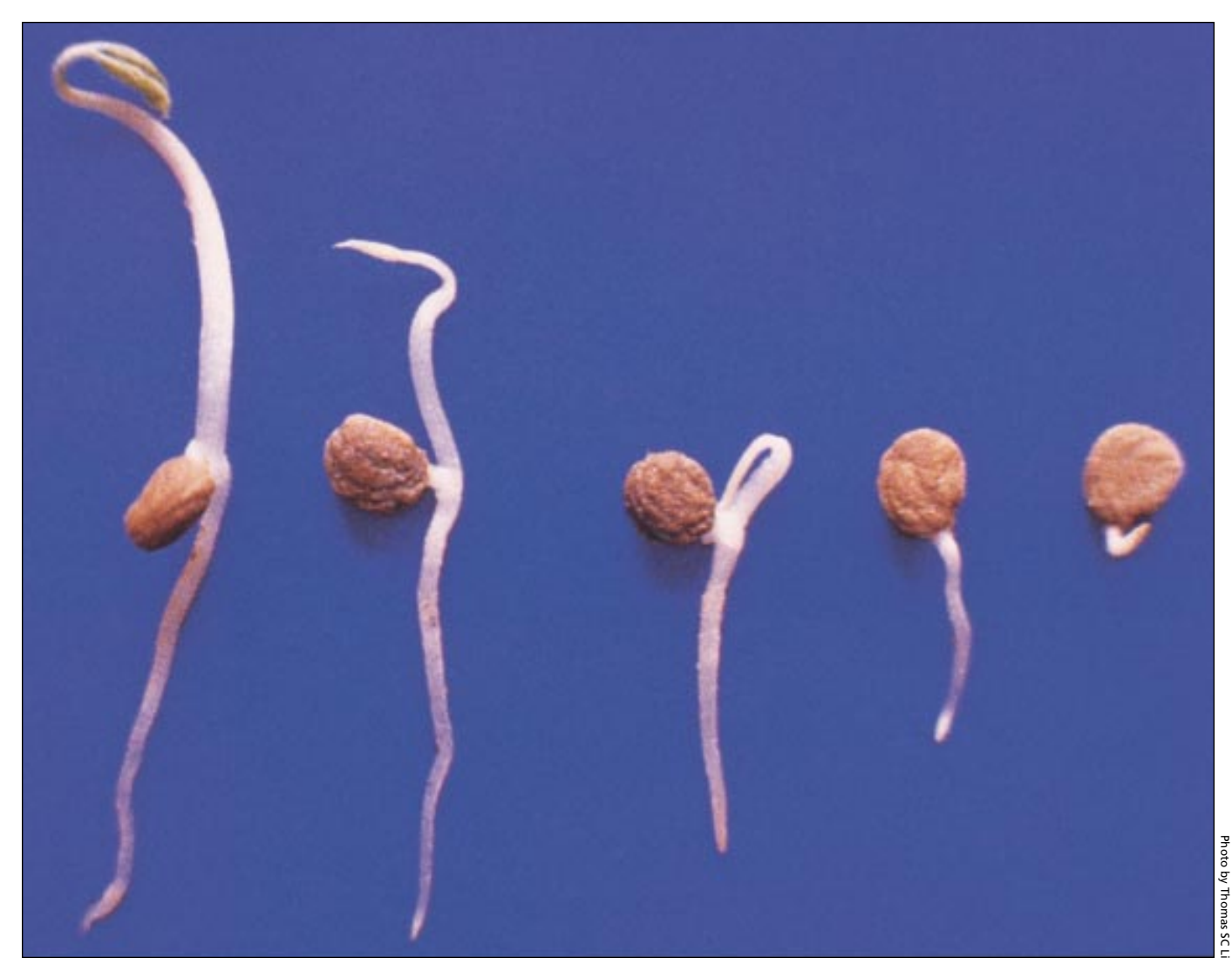
Figure 1 • Germinating American ginseng seeds.