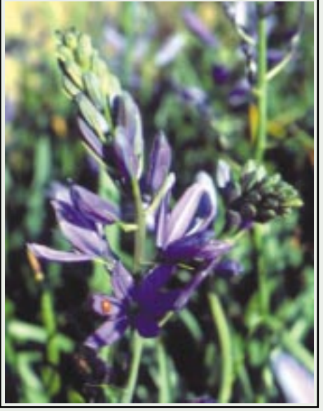
Greater Camas, Camassia leichtlinii

CALL TOLL FREE 1-800-416-8640 EMAIL sales@4th-corner-nurseries.com WEB www.4th-corner-nurseries.com