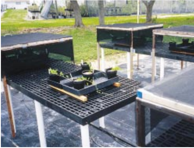
Figure 4. Shade enclosures used for the beach clustervine shade study.

Institute Inc, Cary, North Carolina), and to regression analysis, using the regression procedure of SAS, or regression functions of Sigma Plot (SPSS Inc, Chicago, Illinois). When treatment effects were significant ( \alpha = 0.05 ) treatment means were separated by Duncan's New Multiple Range Test.