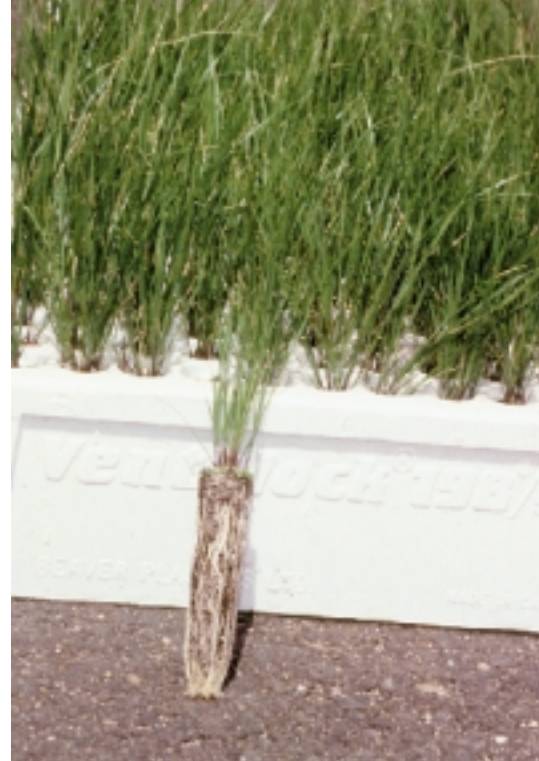
Figure 1 • Twelve-wk-old Elymus glaucus seedlings ready for outplanting.