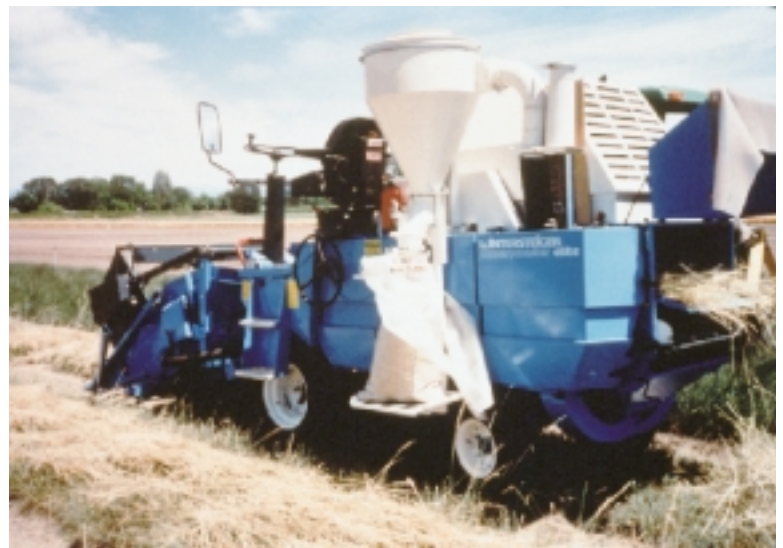
Figure 3 • A Nursery Master Elite 140 plot research combine (Wintersteiger, Salt Lake City, UT) combining swathed Elymus glaucus .

Once a seedlot is harvested, it is placed in a drying bin. Large trays (1.2 X 1.2 X 0.5 m [4 X 4 X 1.5 ft]) with screened bottoms are stacked 5 high over a warm air duct. Air is heated to 38 °C (100 °F) and drawn