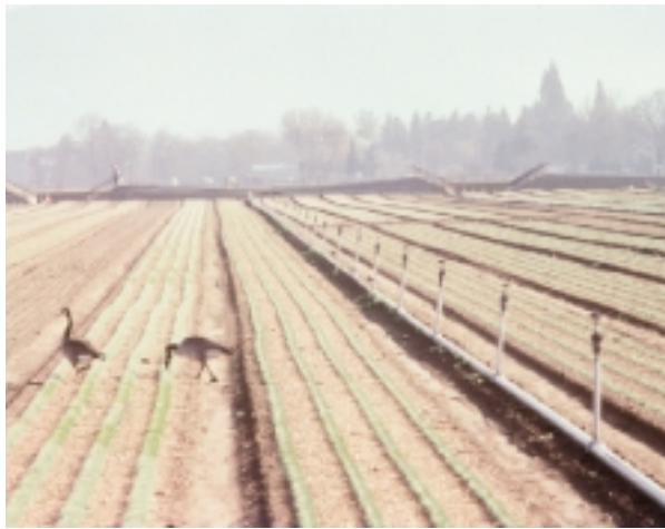
Figure 2 • Rows of emerging Elymus glaucus on 15-cm-wide (6-in) rows.

dry out. The irrigations are very weather dependent, but at our nursery average about 1 to 1.5 h/d. This regime is continued until seedlings emerge, usually 7 to 14 d after sowing (Figure 2).