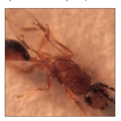
Figure 3 • Juniper seed chalcid.

again at intervals during processing. For less resinous lots, we reduce costs by thinning the hand-cleaner with up to 50% water prior to application. This non-caustic additive reduces cleaning time and improves product quality. Highly resinous lots require additional cleaner, maceration, and rinsing. Seeds are sufficiently clean when, after squeezing a handful of seeds, your empty hand feels barely sticky when closed and opened. Rinse seeds repeatedly to