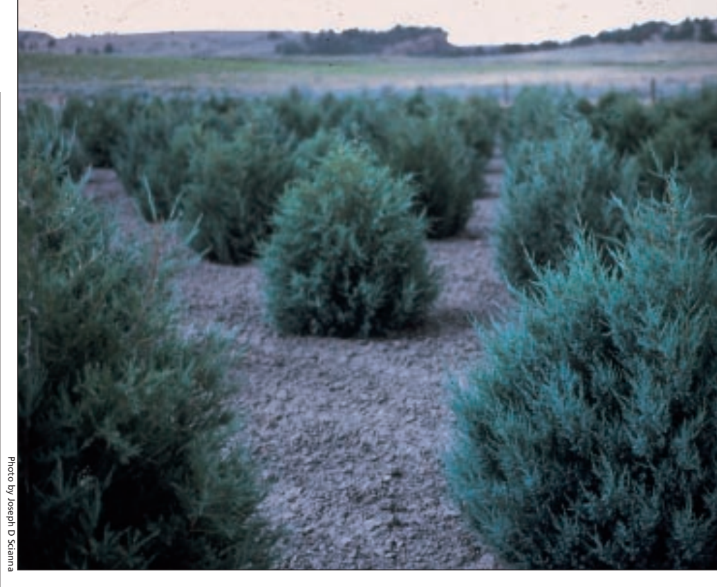
Figure 5 • Rocky Mountain juniper seed orchard at Bridger Plant Materials Center.

Hartmann and Kester (1983) recommend treating other juniper seeds with