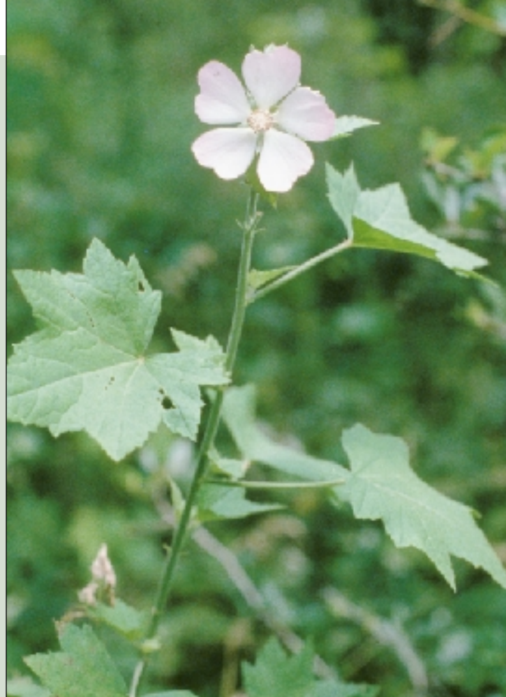
Iliamna remota.