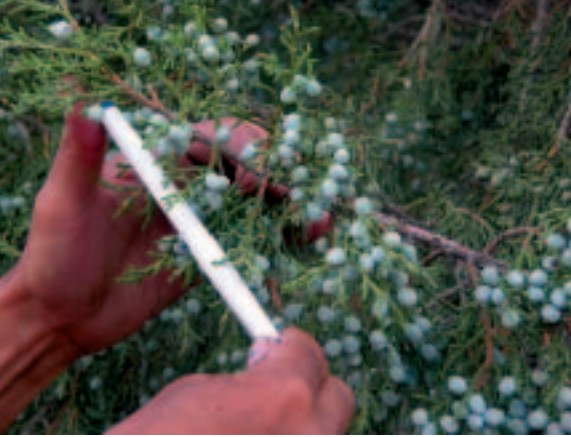
Figure 2. The green, hard juniper fruits develop a bluish color and are usually covered with white, glaucous bloom during the first year, but remember that fruits require 2 y to reach maturity. A cut test can help determine which fruits should be collected.