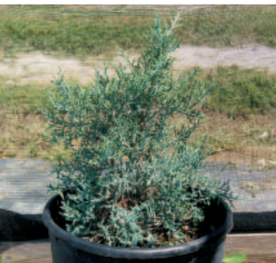
Figure 4. Some seedlings are transplanted during their first growing season into larger containers. Transplanted seedlings require 2 growing seasons before they are ready for market.

(FEIS 2003). They serve as an important cover and food source for birds and for a wide variety of mammals and reptiles.