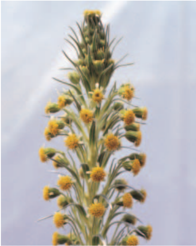
Figure 2. Flowering Mauna Loa silversword.