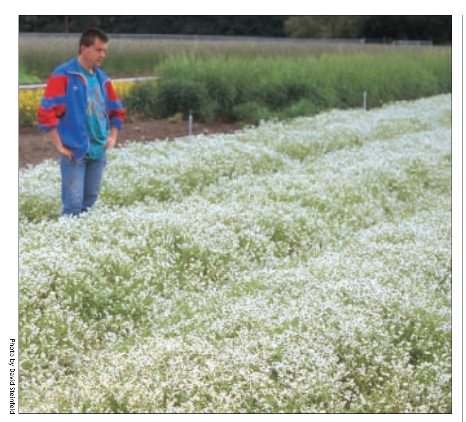
Production beds of fragrant popcornflower (Plagiobothrys figuratus (Piper) I.M. Johnston ex M.E. Peck [Boraginaceae]) at the USDA Forest Service J Herbert Stone Nursery in Central Point, Oregon.

for forbs. Forbs are very exacting in their requirements and little is known about most of them. For new forb species, 5 to 10 y of experience may be required to answer basic management questions such as soil adaptation, water and fertilizer response, seed dormancy, and seeding requirements. Two to five years of seed increase from small-scale blocks may be required before sufficient seed is available for planting of normalsized fields, assuming no delays are incurred. Any expectation that a species such as sulfur buckwheat (Eriogonum umbellatum Torr. [Polygonaceae]) will be ready for field production next spring or this decade is unrealistic unless preceded by adequate research.