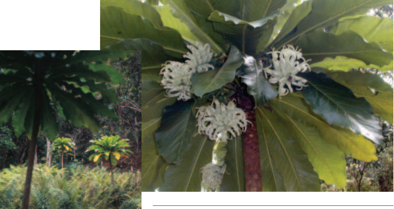
Figure 2. Cyanea superba (Cham.) Gray (Campanulaceae) growing on Oʻahu.

Hawai'i has 150 distinct ecosystems, which makes it a unique global bioregion. Ecosystems include tropical dry forest, subalpine grasslands, montane bogs, alpine communities, coastal dunes, and cliffs. For many of Hawai'i's rarest flora and fauna, loss of habitat is a primary cause for their decline. Of the 150 recognized natural communities, 85 are considered critically endangered. While the loss of a single species is of serious concern, the loss of entire natural communities represents a massive crisis (HNHP 2002).