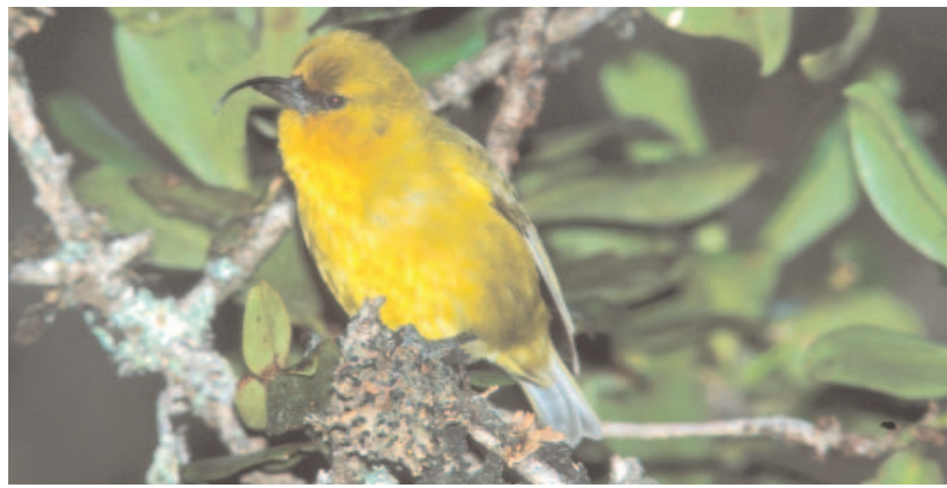
Figure 7. The highly endangered honeycreeper, 'akiapola'au ( Hemignathus munroi ), is benefitting from 15 y of tree planting efforts in Hakalau Forest National Wildlife Refuge.

A greenhouse was built in 1995 and Baron Horiuchi, the refuge's horticulturist, was hired to develop propagation and outplanting techniques for other native species. Fourteen additional native species have been propagated including 6 T&E species and 3 species of concern. The greenhouse produces over 24000 plants per year for outplanting into the refuge. The greenhouse is located on the east slope of Mauna Kea at 1920-m (6400-ft) elevation. The refuge relies heavily on volunteers from conservation groups, schools, service clubs, and other organizations to help with propagation, outplanting, and removal of nonnative plants and animals.