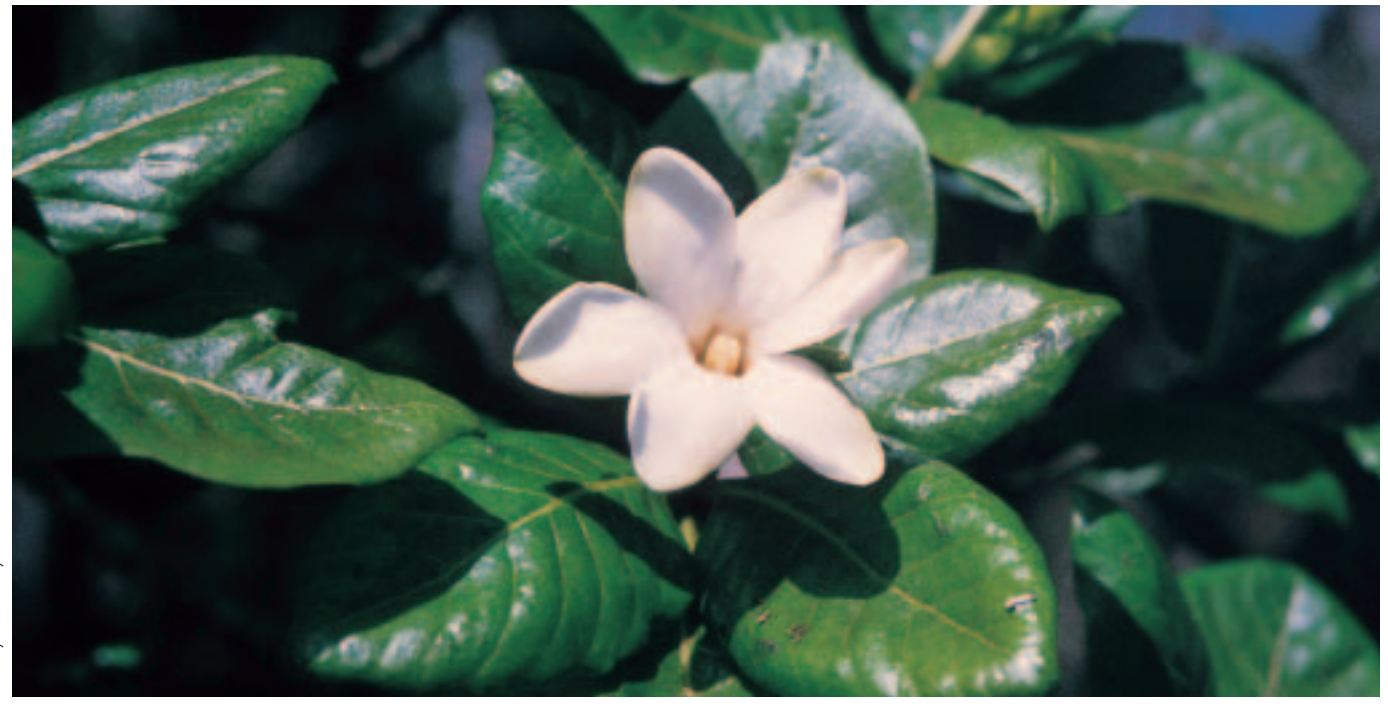
Figure 6. Hawaiian gardenia (Gardenia brighamii).

especially with Lāna'i sandalwood. During the past few drought years, however, rats have disappeared from the lower elevations on the preserve, and natural seedling recruitment of this species has increased.