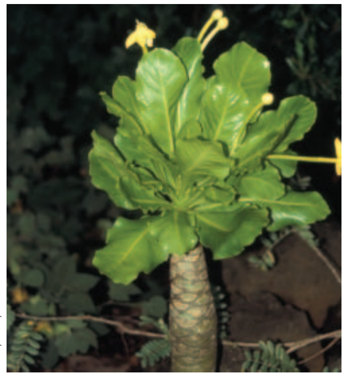
Figure 9. ' \overline{O} lulu (Brighamia insignis) blooming in its cliff face habitat. Its natural pollinators thought to be extinct, this rare plant must be pollinated by hand.

botanists who have helped to develop conservation protocols, plans, and to identify areas of greatest endemism and highly imperiled areas throughout the state. They have made many new discoveries of species, rediscoveries of species thought to be extinct, and discovery of a new genus.