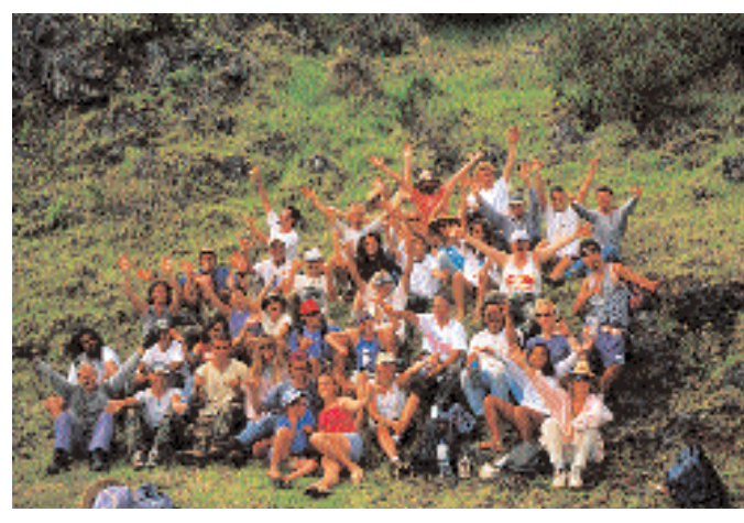
Figure 4. Volunteer groups, like this one on Maui, are essential to the success of restoration activities throughout the Hawaiian Islands.

Outplanting seedlings proved difficult in some situations. Introduced rats ( Rattus rattus L. [Muridae]) are a problem,