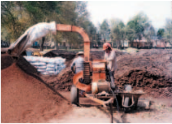
Figure 1. Custom built hammer mill.