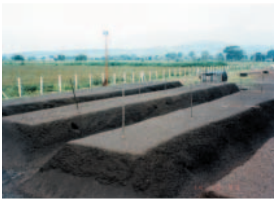
Figure 2. Compost piles at Ciudad Guzmán Forest Nursery, Jalisco México.