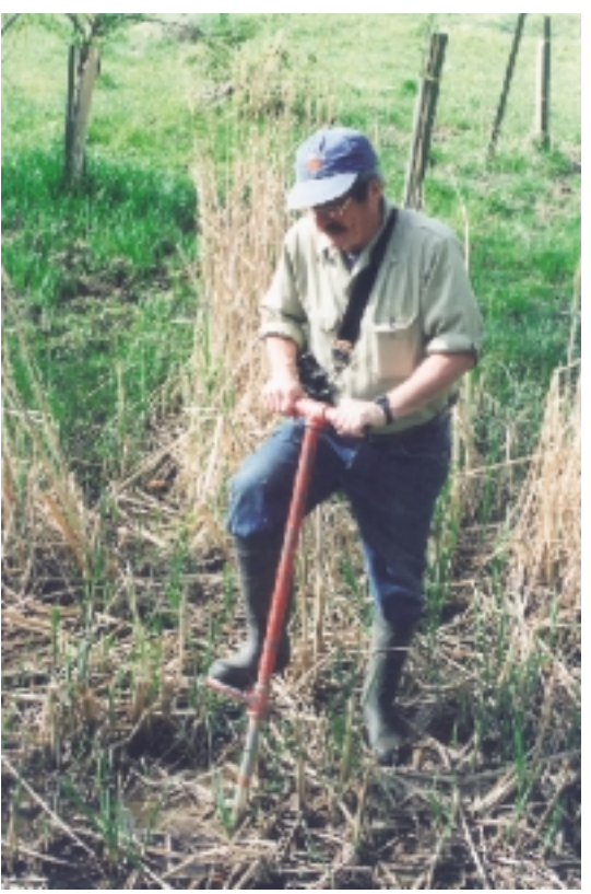
Figure 1 • Foot pressure and a rocking back and forth motion are used to force dibble into hard or rocky soil.