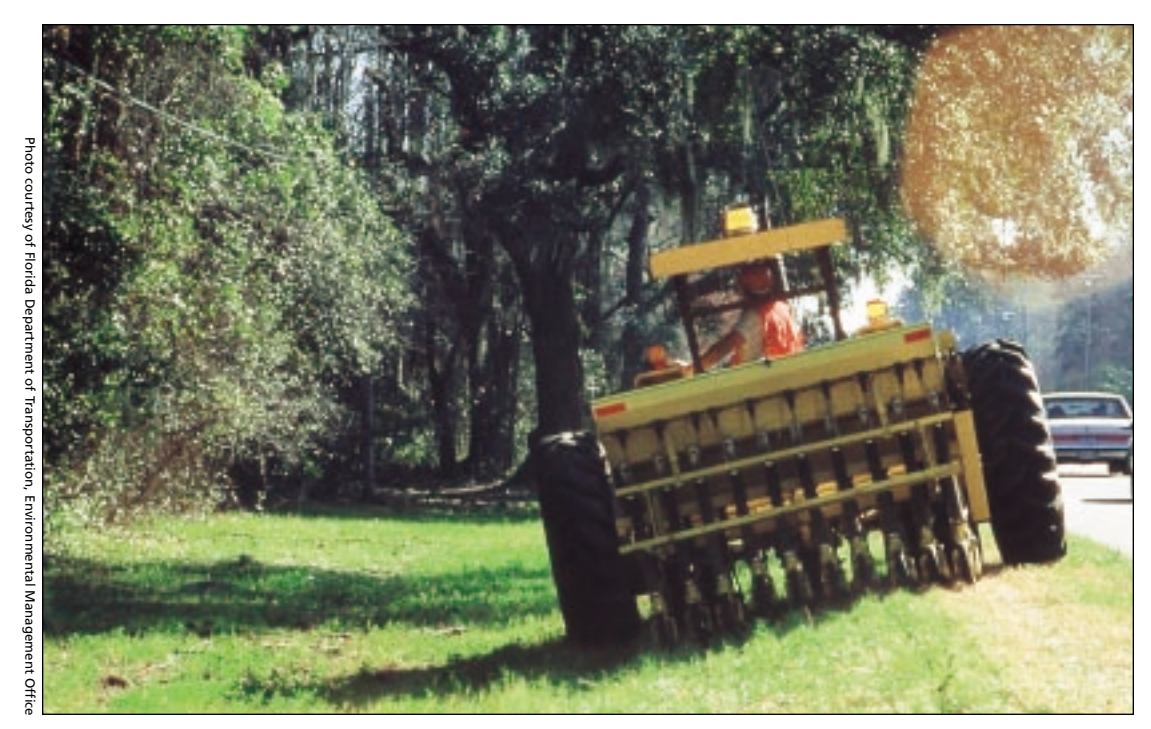
Figure 2 • The Florida Department of Transportation drilling wildflower seeds along a highway.

Corley (1990) concluded that bloom quality and plant height of a southeastern US wildflower mix, averaged for all species within the mix, increased on 2 sites (loamy sand and clay) with biannual applications of 560 or 1120 kg/ha (500 or 1000 lb/ac) of 16N:4P<sub>2</sub>O<sub>5</sub>:8K<sub>2</sub>O or 18N:6P<sub>2</sub>O<sub>5</sub>:12K<sub>2</sub>O. Application of 560 kg/ha (500 lb/ac) of 10N:20P<sub>2</sub>O<sub>5</sub>:20K<sub>2</sub>O and organic material(s) that will improve the soil nutrient level and structure are recommended when no soil analysis is performed (Johnson 1995).