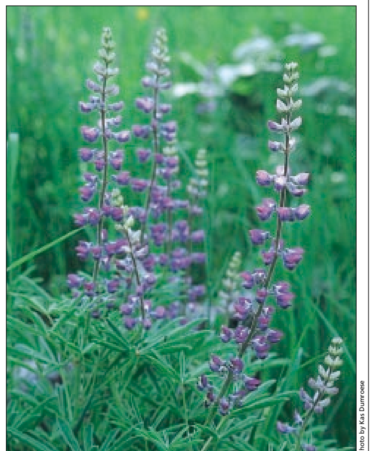
Silky lupinje (Lupinus sericus Pursh [Fabaceae]).