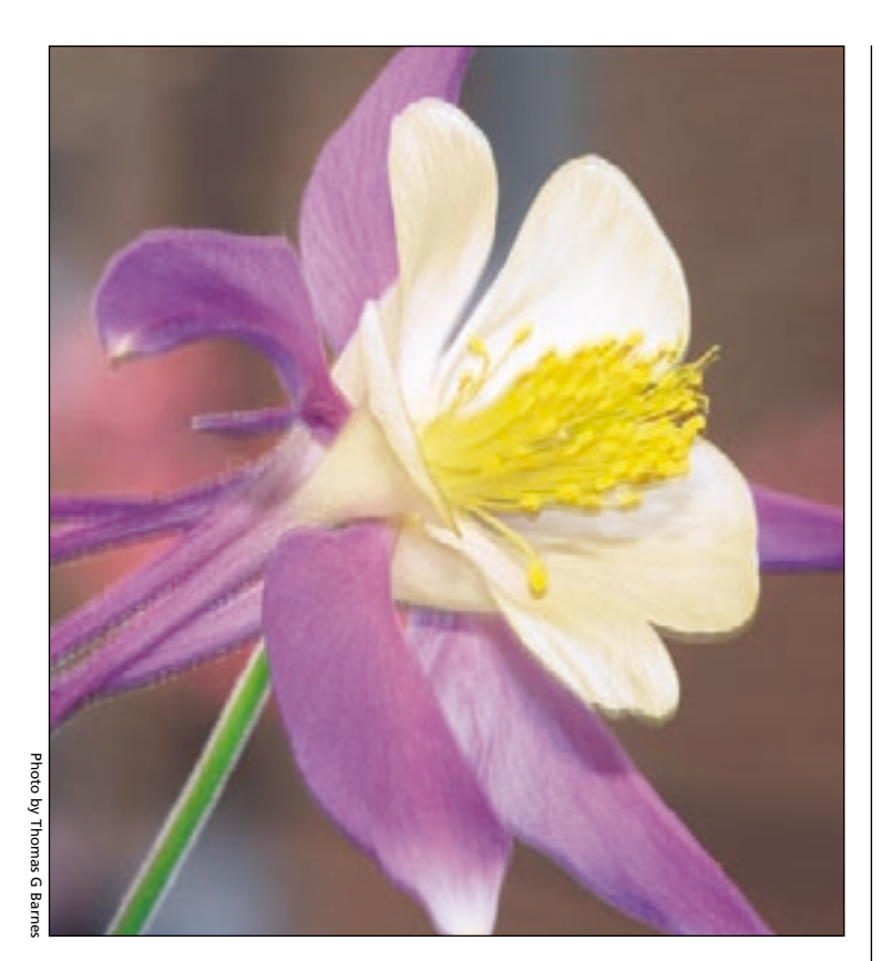
Colorado blue columbine (Aquilegia caerula James [Ranunculaceae]).

(Elmhirst and Cain 1990; Gallitano and Skroch 1990; Skroch and others 1990, 1995; Derr 1993; Erusha and others 1991; Gallitano 1991; Agnew and Hatterman-Valenti 1993; Corley and Murphy 1994; Masters and others 1996; Harkess and Lyons 1997; Pywell and others 1998; Beran and others 1999a,b; Washburn and others 1999; Washburn and Barnes 2000). So far, the magic bullet that will completely control all broadleaf and grassy weeds without injury to all wildflower species is missing. Therefore, efforts continue to find the herbicide, or combination of herbicides, at rates and stage of the wildflower development that could prove the most useful on different wildflower species. These variables, in addition to differences in seed source, soils, climate, and uncertain herbicide availability attest to the amount of research that has, and could be undertaken, to address these factors.