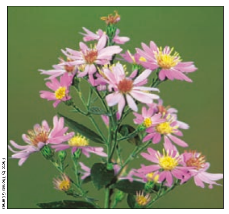
Short's aster (Symphyotrichum shortii (Lindl.) Nesom formerly Aster shortii Lindl. [Asteraceae]).

ciated with planting that allows invasive weed seeds an opportunity to germinate. Over time, weeds have deposited seeds in the topsoil which germinate and grow at various times. It is suggested that between 98 and 3068 viable weed seeds occur in the upper 15 cm (6 in) of soil in a 0.1 m² (1 ft²) section (Gallitano and others 1993). Another estimate of the extent of the weed seedbank is that there are 202 kg/ha (180 lb/ac) in the top 5 cm (2 in) of soil (Albright Seed 1998a). In other words, weed control is key to successful establishment of a native wildflower planting. Success starts with evaluation of the proposed wildflower site.