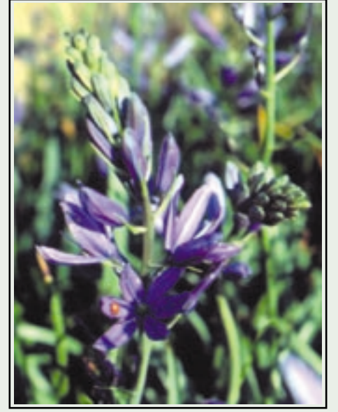
Greater Camas, Camassia leichtlinii

CALL TOLL FREE 1-800-416-8640 EMAIL sales@4th-corner-nurseries.com WEB www.4th-corner-nurseries.com