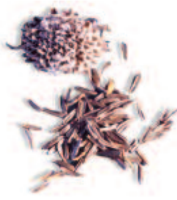
Figure 3. Balsamorhiza sagittata seed heads and cleaned seeds.

Our research objectives were influenced by the difficulties inherent with propagating and cultivating arrow-leaved balsamroot. First, this species has low seed viability (Young and Evans 1979). Furthermore, preliminary trials by Young and Evans (1979) determined that freshly matured seeds are dormant, and this dormancy is not broken in dry storage. Kitchen and Monsen (1996) concluded that seed dormancy in this species prevents summer or fall germination. Experiments aimed at finding methods to enhance seed germination and to find optimal conditions for breaking dormancy. Second, arrow-leaved balsamroot is adapted to arid growing conditions, therefore, we wanted to determine if seedlings would survive in a greenhouse environment (usually humid), which often leads to accelerated plant development.